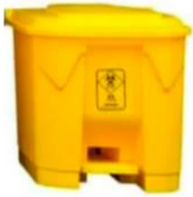
Medical/Infectious Waste Step-On Containers 30L