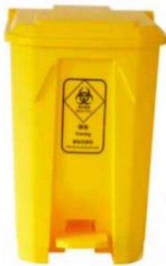
Medical/Infectious Waste Step-On Containers 50L