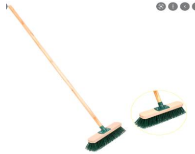
Push Brush with Handle